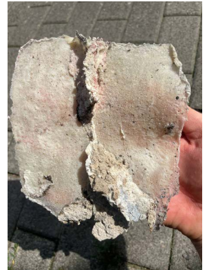
Fig.1–3: latex-moulding, step by step.